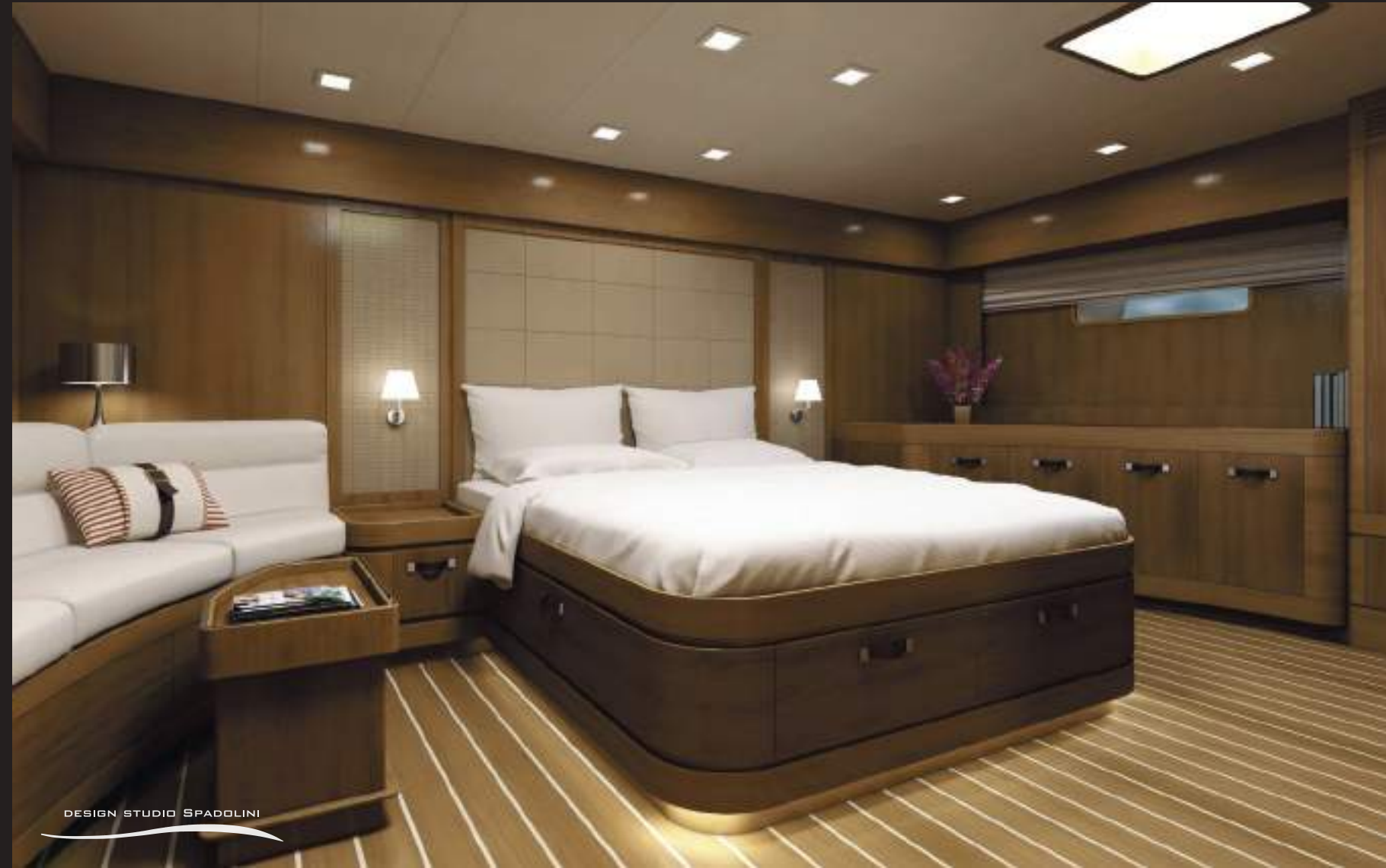
Master cabin - preliminary concept