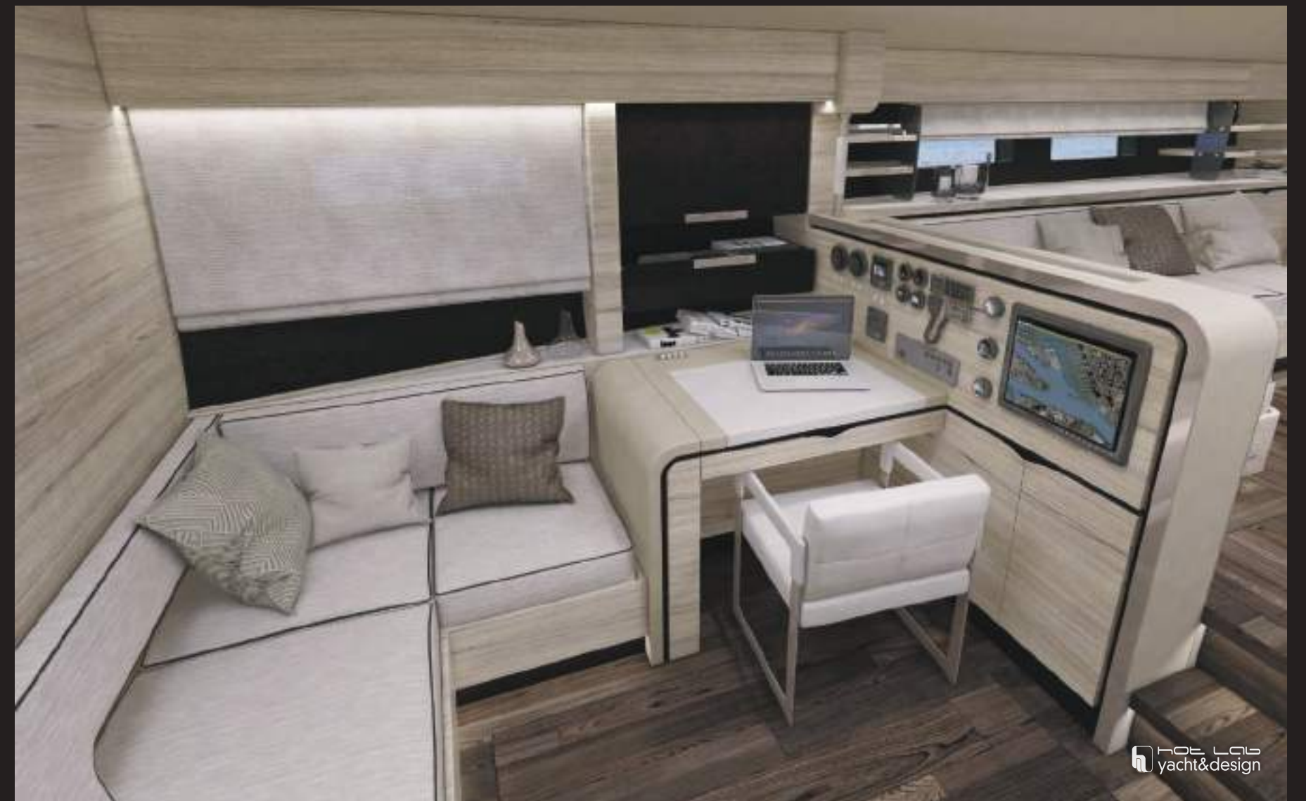
Main saloon - preliminary concept