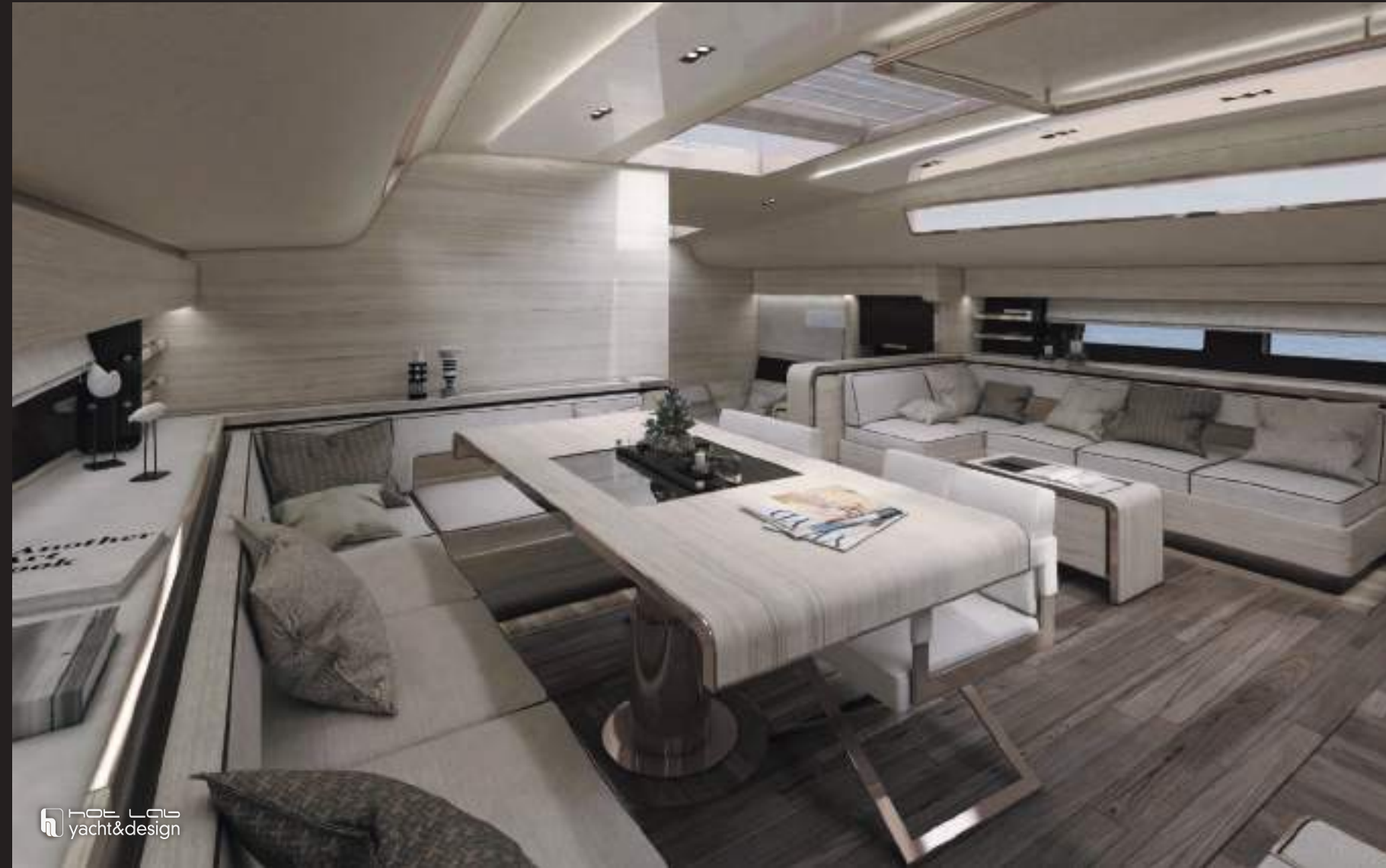
Main saloon - preliminary concept