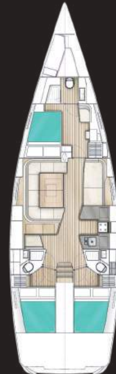
LOWER DECK OPTIONAL