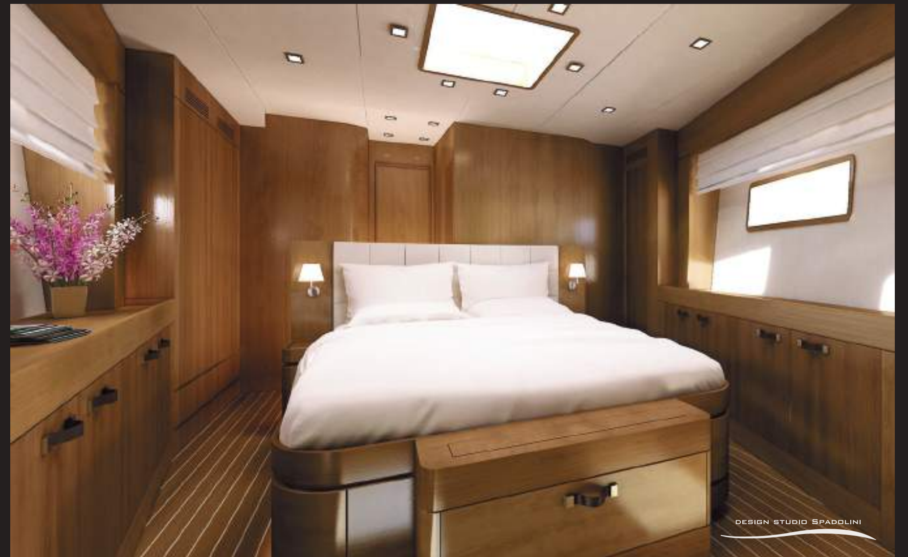
Master cabin - preliminary concept