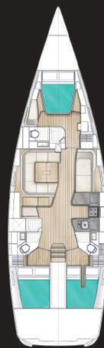
LOWER DECK STANDARD