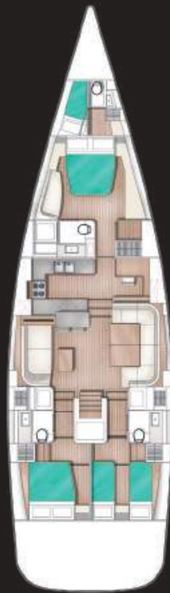
LOWER DECK LAYOUT A