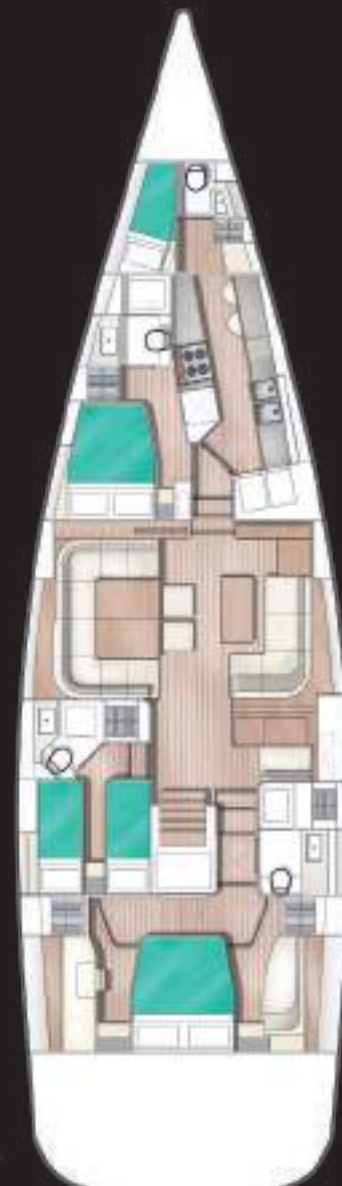
LOWER DECK LAYOUT C