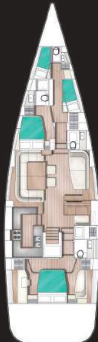
LOWER DECK LAYOUT B