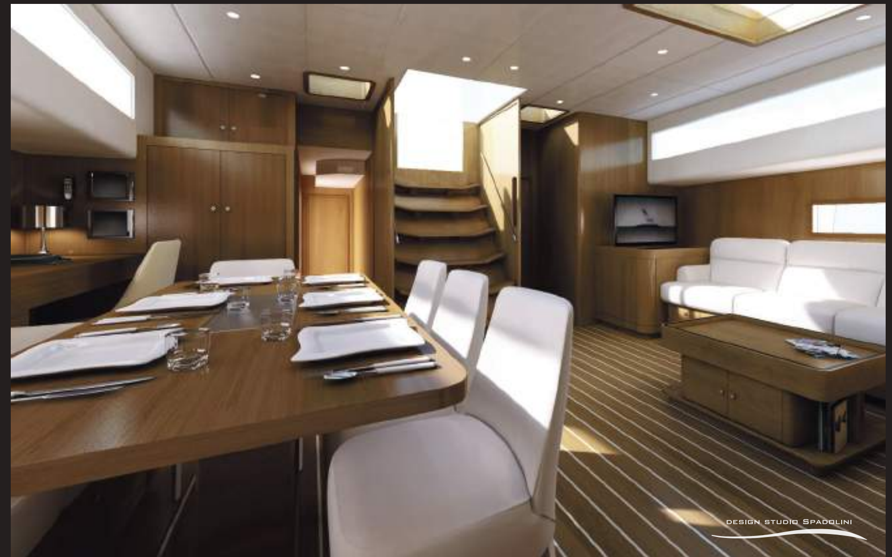
Main saloon - preliminary concept