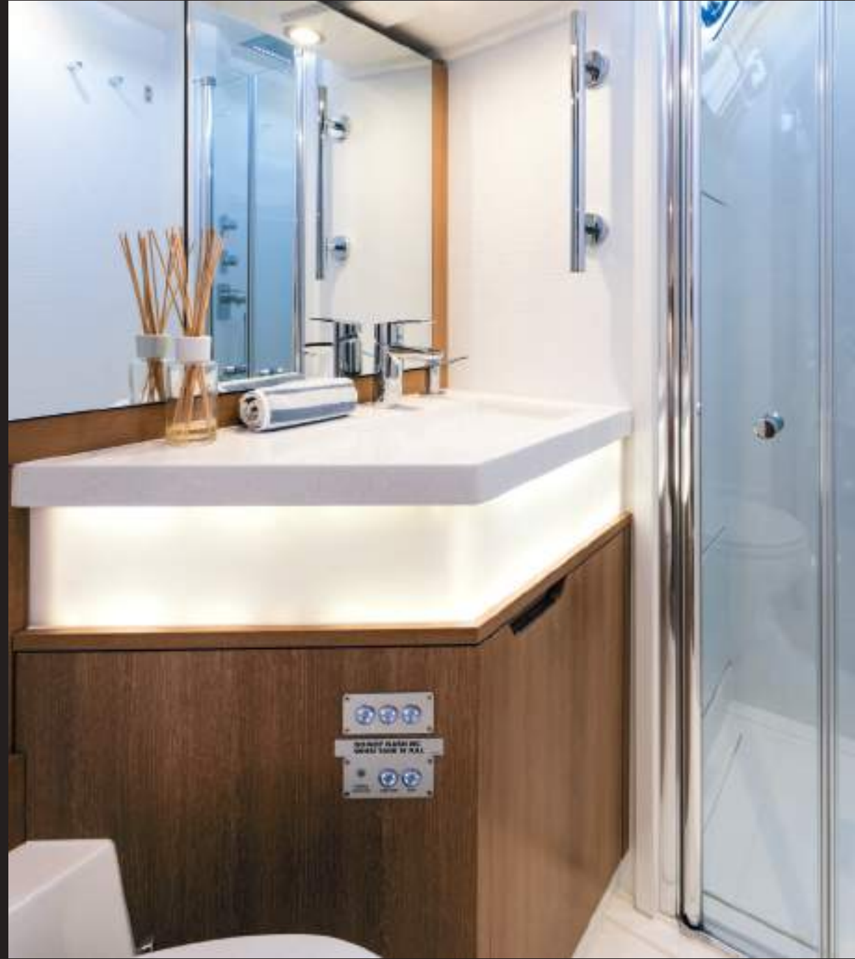
Master cabin head