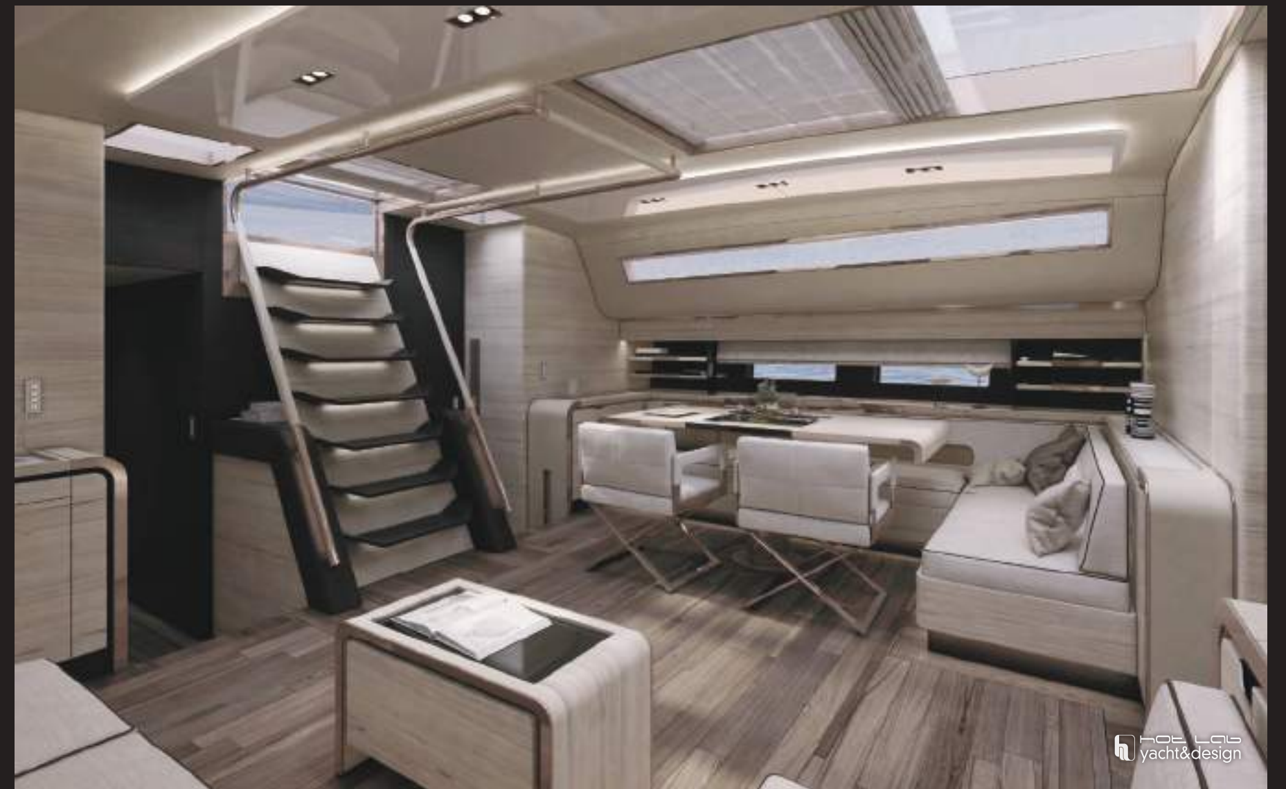
Main saloon - preliminary concept